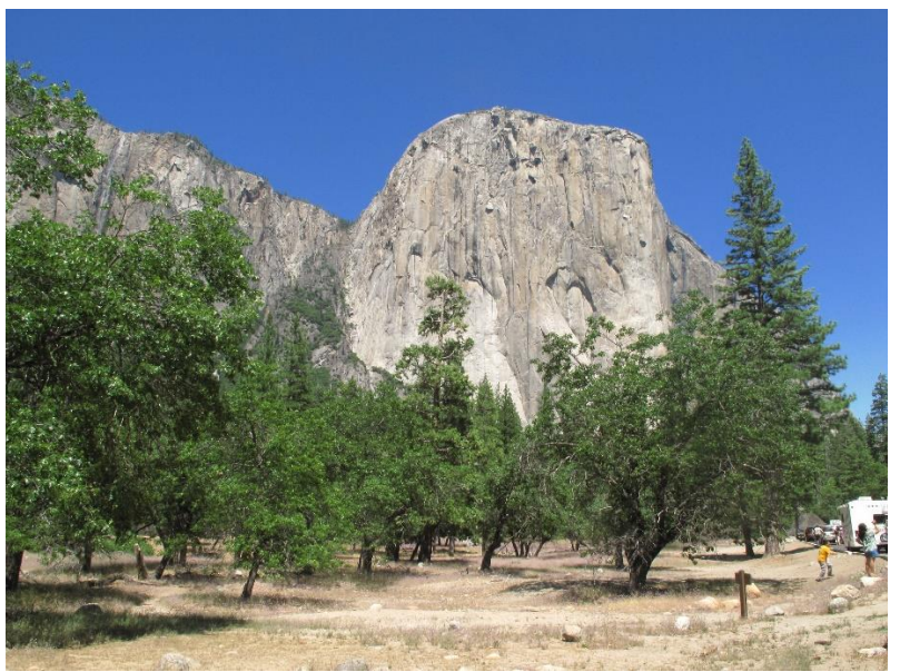
The granite of El Capitán , which is 100 million years old, bears witness to a time when the North Atlantic was half its current width.