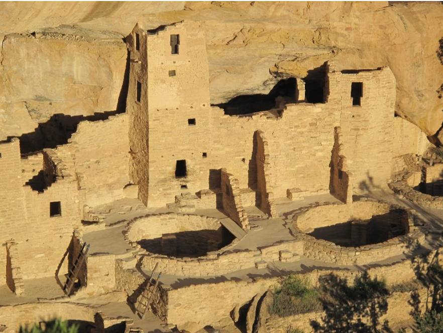
Mesa Verde, in Colorado: the place began to be inhabited almost 12,000 years ago

editor, philosopher and politician Benjamin Franklin (1705/6-1790), native of Boston, one of the founders of the United States and one of the greatest names in the History of Sciences.