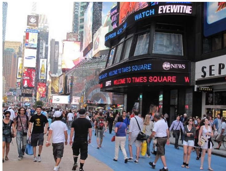
New York: the "city that never sleeps", home of the self-made man and stage of the American way of life