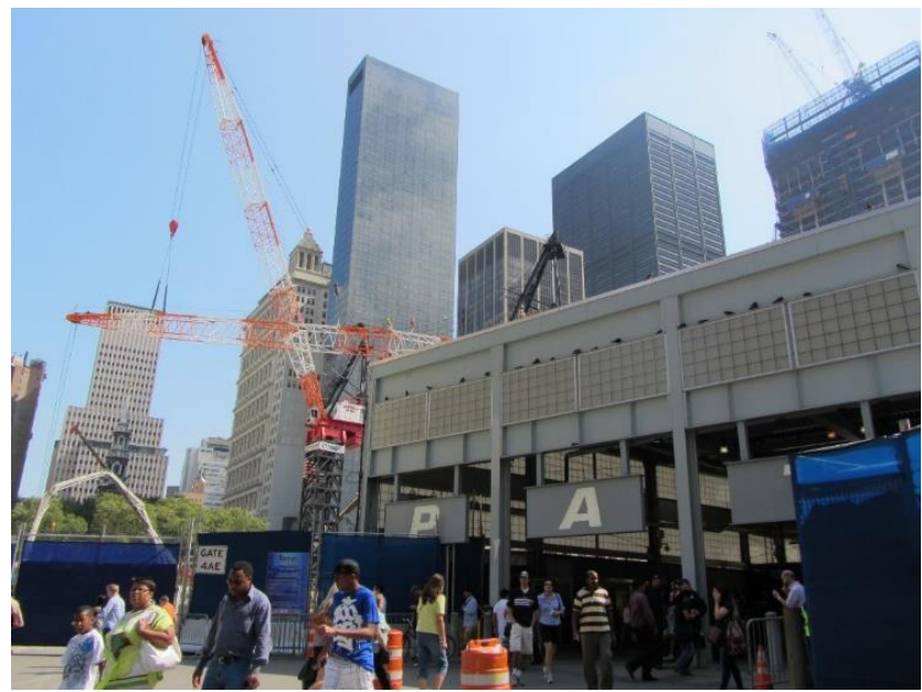
From 1973 to 2001, here in Manhattan, the Twin Towers stood

Geographical advantages – of which there are many – would be of no use if there were not, in the USA, a people duly willing to make the most of them. That is what happened: British pioneers came, saw and defeated both the former owners of those endless lands and the difficulties that Nature imposed on them, making them the richest and most powerful nation of all time. My guide here is the Brazilian writer Clodomir Vianna Moog (1906-1988), author of this unparalleled book, Bandeirantes and Pioneers: Comparisons Between Two Cultures , in which he compares, with abundance of data and arguments, the reasons why the United States are the United States and why Brazil is Brazil.