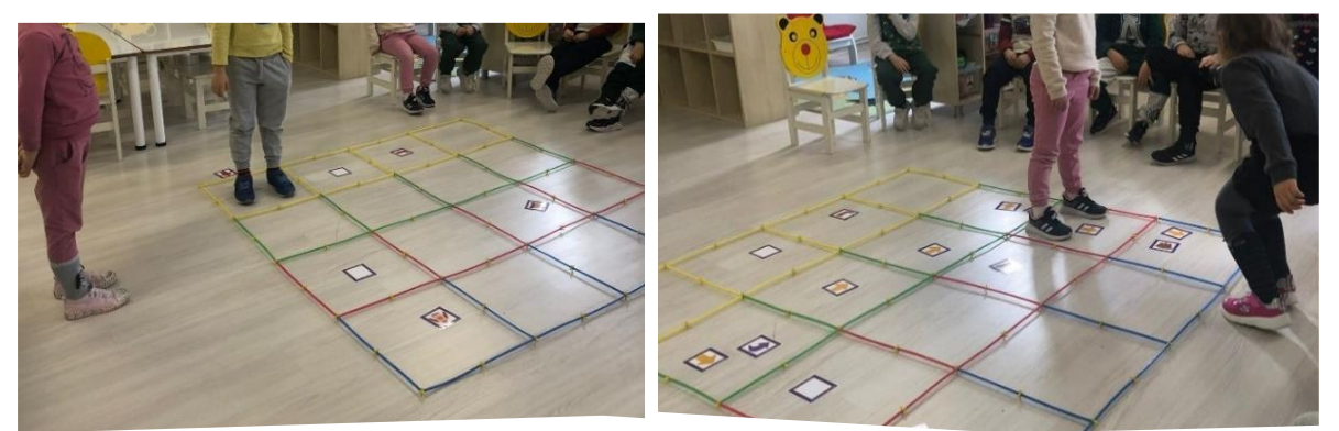
Figure 3. Implementation Process of the Seasons Activity