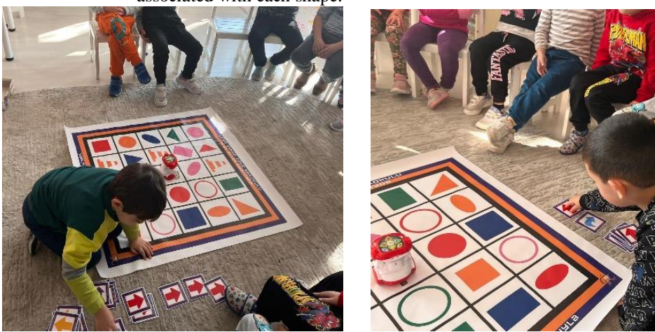
Figure 4. Implementation Process of the Geometry Activity