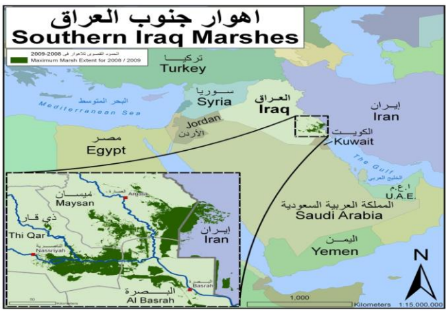
Figure 1: Location of southern Iraq marshes

Figure 2 show that the marshes constitute a large proportion of the area of the southern part of Iraq, which is the region that is represented between Maysan Governorate in the north, Basra Governorate in the east and south, and Souq Al Sheikh in the west. The marshes of southern Iraq and the surrounding areas are characterized by the prevalence of the freshwater environment; the areas have been exposed to drought in recent centuries due to the large number of dams on the Tigris and Euphrates, such as the Al-Hindiya dam on the Euphrates and the Kut dam on the Tigris River.