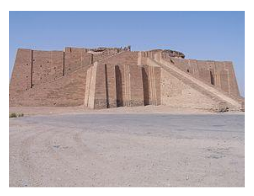
Figure 1: The Ziggurat of Ur in Nasiriyah, southern Iraq

these areas "Al-Bataih", the plural of Batiha, because the water settled in it, that is, it flowed and expanded in the ground, and reeds were growing in it.