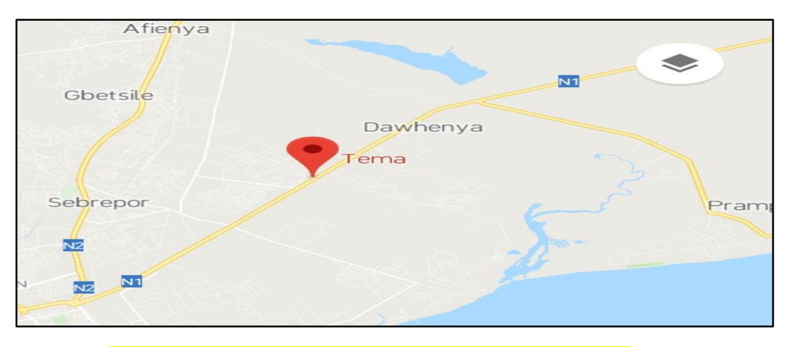
Figure 2: Aerial Map of Tema Metropolis Showing the Study Area

Research Design : The study adopted the explanatory mixed method approach to facilitate the achievement of the stated objectives of the study. The explanatory mixed method is also known as the sequential explanatory (Creswell, 2012). It occurs in two distinct interactive phases. This research design starts with the collection and analysis of quantitative (numeric) data, which has the priority for addressing the study questions. This beginning stage is accompanied by the subsequent collection and analysis of qualitative (text) data. The second, qualitative phase of the study is designed so that it follows from the results of the first, quantitative phase (Creswell, 2012). The rationale for this approach is that the quantitative data and their subsequent analysis will provide a general understanding of the research problem (Creswell & Plano-Clark, 2007; Creswell, 2009). According to Denscombe (2007) researchers can improve their confidence in the accuracy of findings through the use of different methods to investigate the same subject.